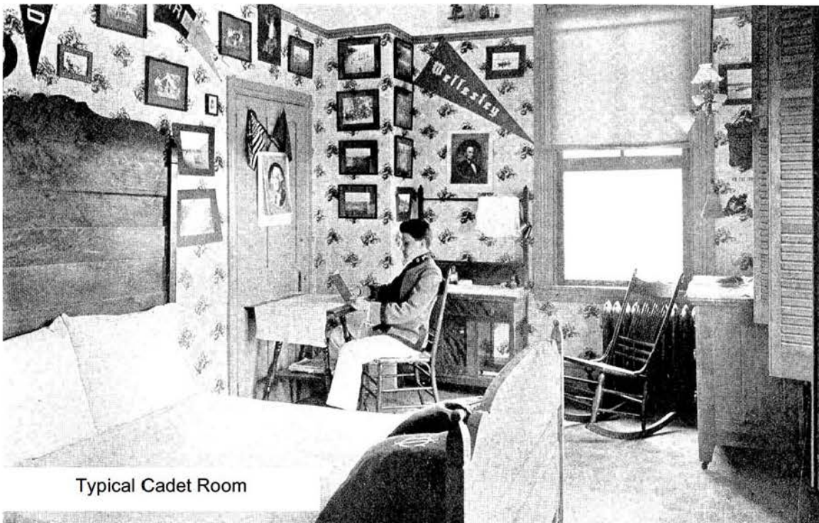
Typical Cadet Room

We are desirous of welcoming boys who are imbued with manly hopes and ambitions. Wenonah Military Academy is essentially a school for gentlemen's sons. We want only boys and young men who will work during study time; who will play, and play heartily, during play time; boys who will at all times be high-toned, courteous gentlemen. With such material it is a teacher's greatest happiness to get at the boys and instill ideals and principles that may guide them through life. The teachers enter into all the interests of the boys, and seek to develop their best potentialities on every side.