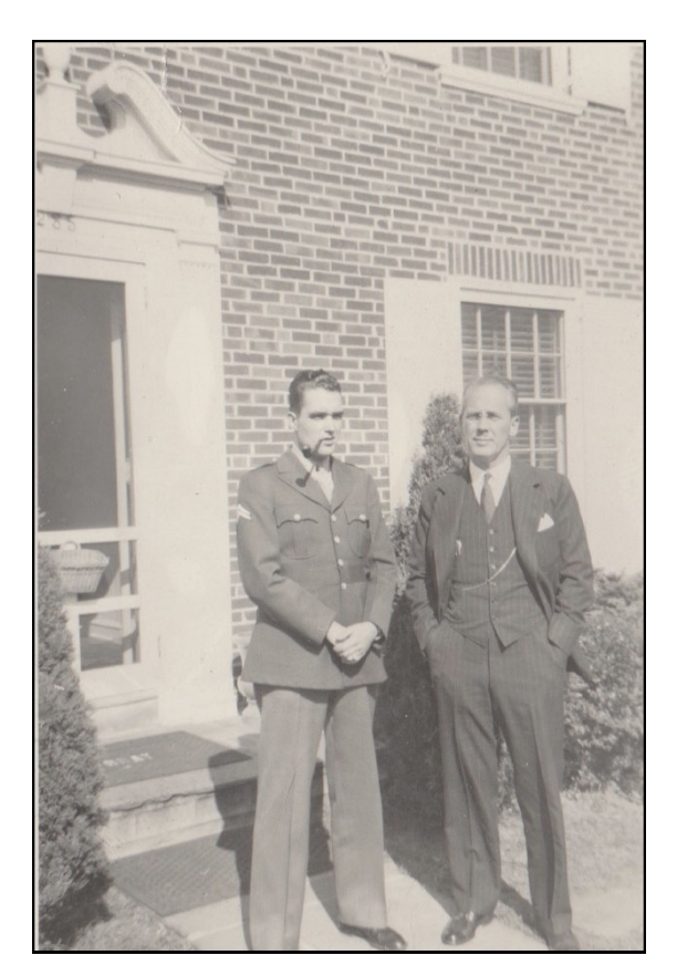
House number is 285. Last two letters on welcome mat are "AY."