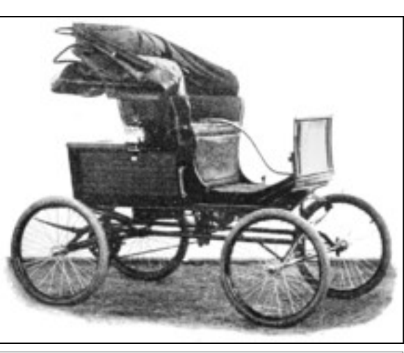
From Popular Science Monthly , Vol. 57 December 31, 1899

The contest was announced on the front page with a photograph of the grand prize, a 1900 Locomobile worth $750. The name of the vehicle was derived from combining the words <u>loco</u>motive and auto<u>mobile</u>. An acceptable minimum wage at that time was about $8 per week. If you could somehow manage to put $1 a week away to buy the car you could expect to be driving in 15 years! Another way to consider the value of the prize was that houses built on the west side of the railroad tracks in Wenonah were supposed to be worth a minimum of $1,000 and houses on the east side $2,000. The top 20 contestants would get an expense paid trip to At-