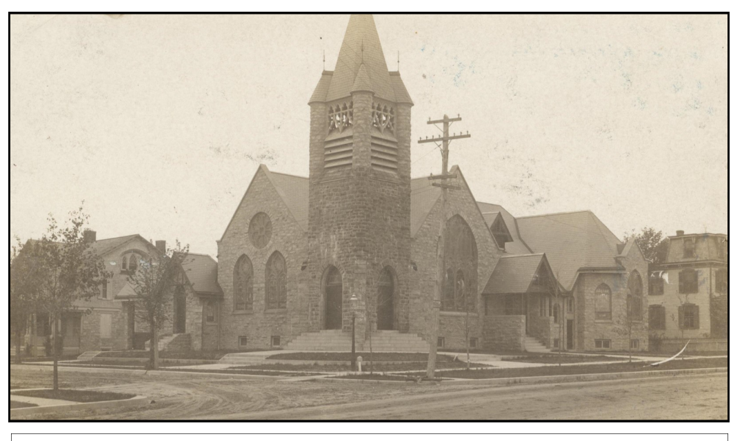
Postcard of the Wenonah Presbyterian Church, circa 1910