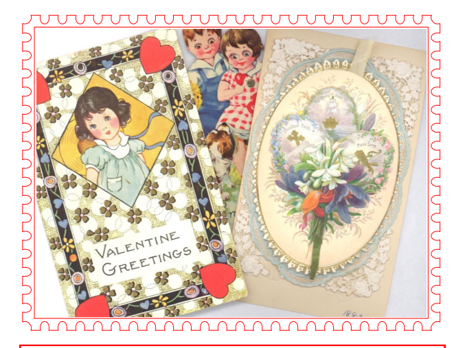
Valentine Cards