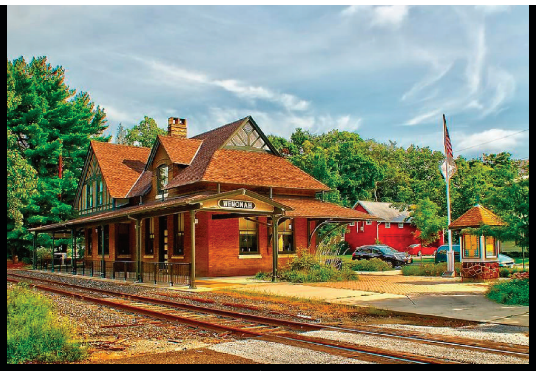
Wenonah Train Station