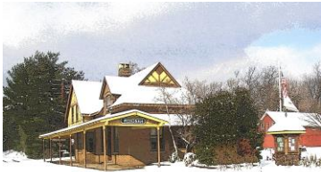
Wenonah Station Winter 2005